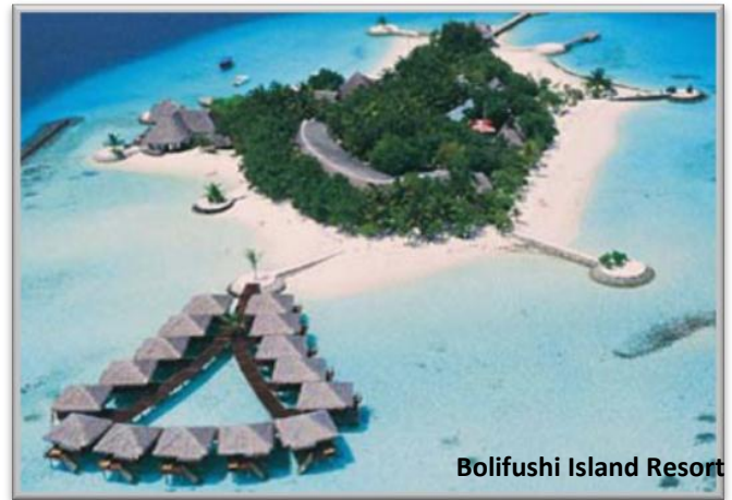
Bolifushi Island Resort