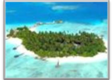
Rasfari Dive Site